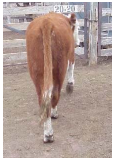
No. 2 Muscling