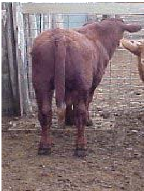
No. 1 Muscling

The basic shape of the hindquarter (round) as viewed from behind.