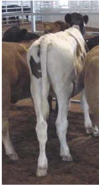
No. 3 Muscling